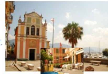
Piazzetta S. Erasmo