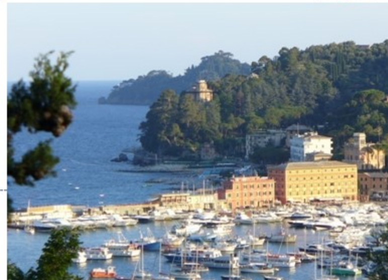
Villaggio Ospitalità: Calata del Porto