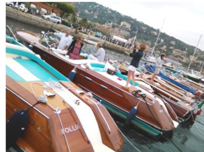
Immagini dell'edizione 2015

Also 2017 Tribute is under the patronage of "Riva Historical Society" and "Riva Society Italia" Associations, promoting it among their members.